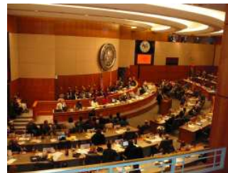
Joint Session of the NM Senate & House

Next July Tech Trek New Mexico will be at Highlands University in Las Vegas, New Mexico. That is right in our own backyard. I hope many of our members will be willing to volunteer for Tech Trek. Volunteers are needed to interview potential applicants, serve as dorm monitors and provide supplies. Also donations of money will be appreciated.